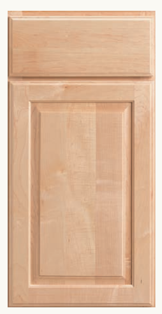
Somerton Hill (M,C) (FO) Also available in an arch doorstyle.