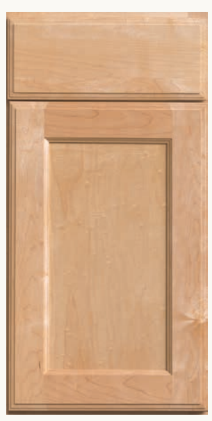
Ralston (M,C) (FO)