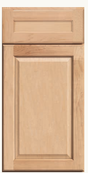
Fox Harbor* (M,C) (FO)