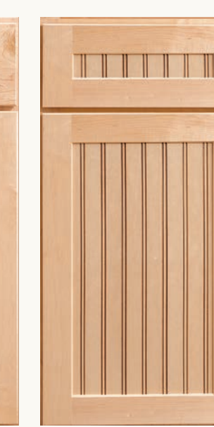
Avenue* (M,C) (FO)

Cherry (C) FO = Full Overlay Hickory (H) PO = Partial Overlay