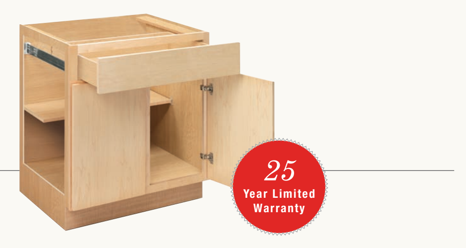
Durable Standard Construction