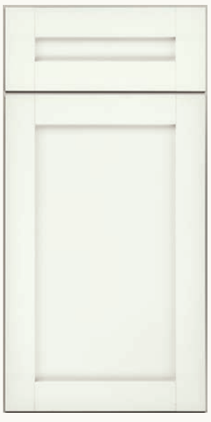
Vance* (L) (FO)