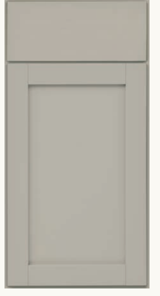
Vance (L) (FO)

Textured Laminate is a plastic-based product that has proven to be highly durable. This cabinetry gives you a consistent appearance.