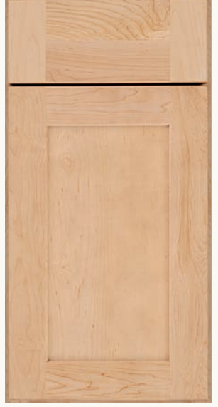
Tolani** (M,O,C) (FO)