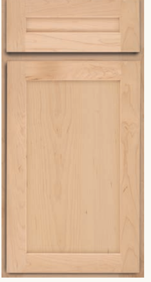
Marlin* (M) (PO)