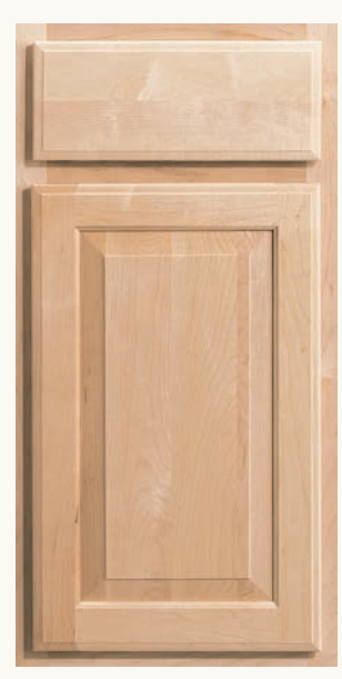
Sutton Cliffs (M, O, C, H) (PO)