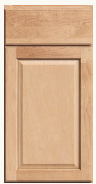
Fox Harbor (M,C) (FO)