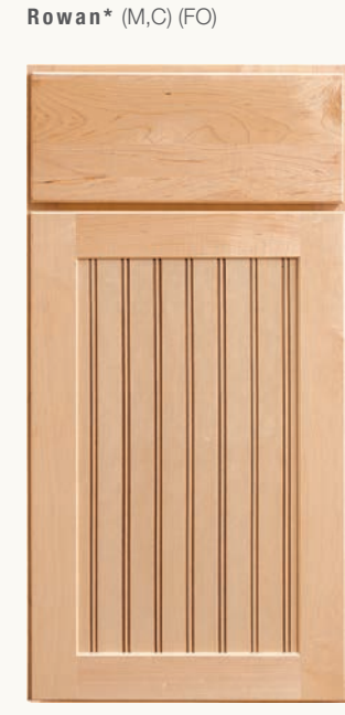
Avenue (M,C) (FO)

* Optional 5-piece drawer front shown ** Optional 3-piece drawer front shown