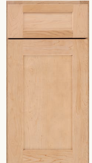
Tolani* (M,O,C) (FO)