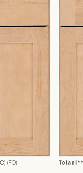
Tolani (M,O,C) (FO)