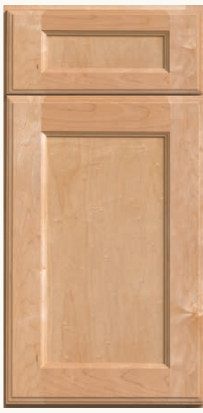
Ralston* (M,C) (FO)