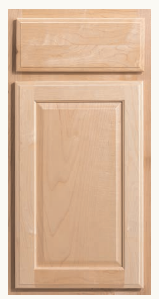
Seneca Ridge (M,O,C) (PO) Also available in an arch doorstyle.

\texttt{Glenrock*}(\mathsf{M})(\mathsf{FO})