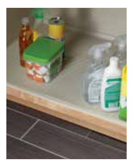
CoreGuard<sup>®</sup> This CoreGuard sink base cabinet is designed to protect against damage from unseen leaks and spills.

QualityCabinets offers a wide variety of accessories to create a highlyfunctional and beautiful space. Our accessories are easy to use, easy to clean and designed for every budget.